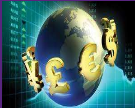
Global Economy 全球经济