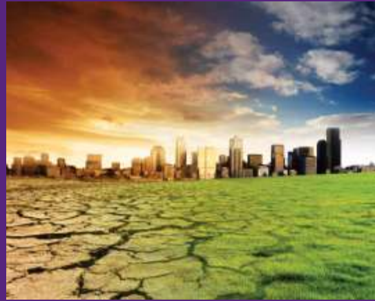
Climate Change 气候变化