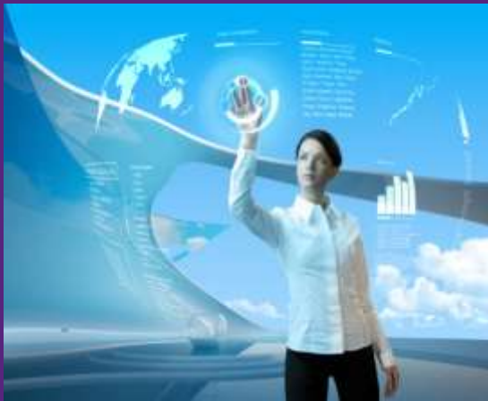
Future of Work 工作的未来