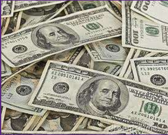
Income Inequality 收入不平等