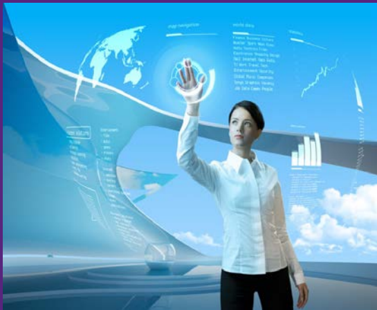
Future of Work 工作的未来