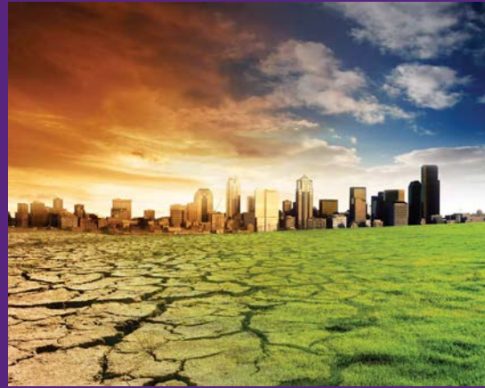
Climate Change 气候变化