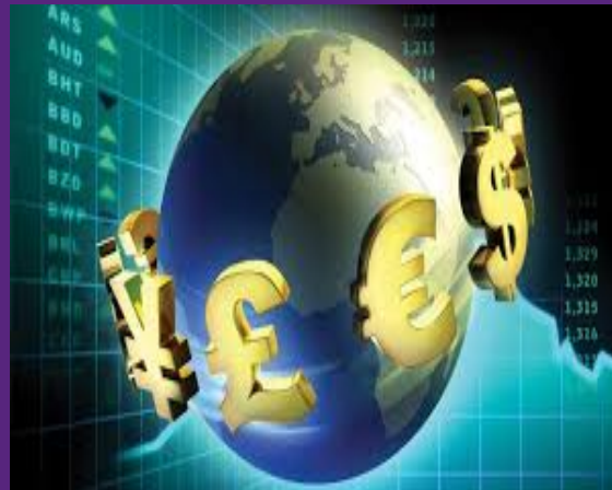
Global Economy 全球经济